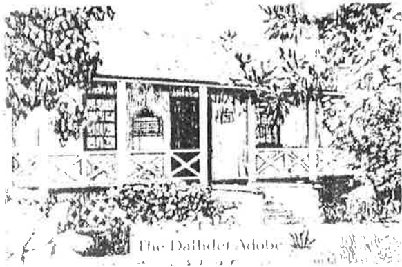
The Dallidet Adobe