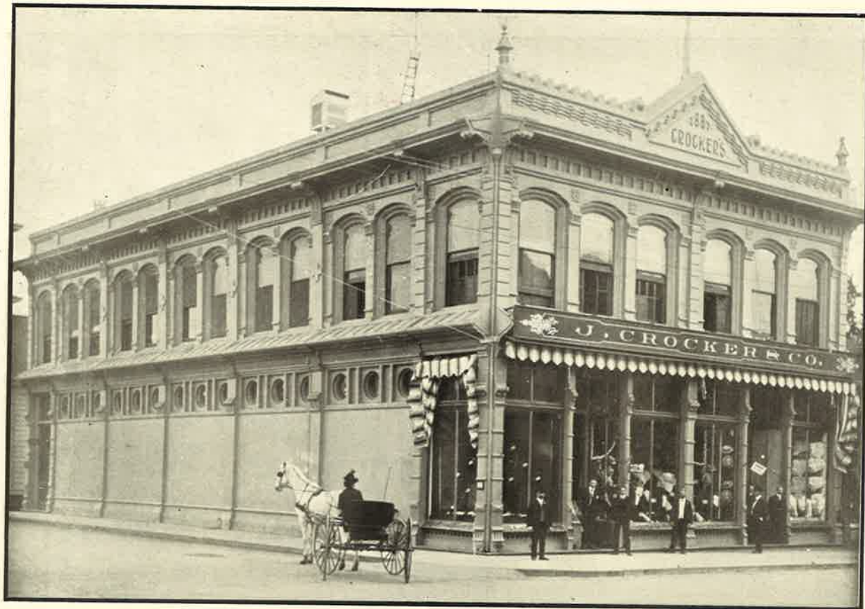
CROCKER BUILDING—CROCKER'S BIG DEPARTMENT STORE, Corner Higuera and Garden Streets.